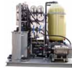
SW Series (right side view)