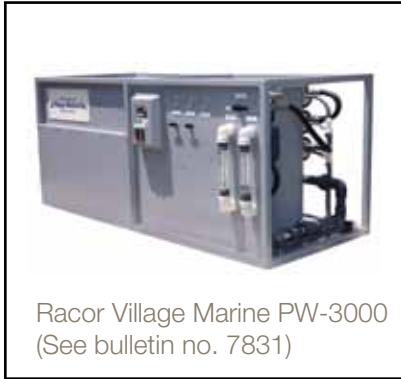
Racor Village Marine PW-3000 (See bulletin no. 7831)

The Pure Water (PW) Series is designed to provide installation flexibility, superior performance, and extended service life in the most rugged conditions. PW units are typically installed in 24/7, continuous-duty applications. Each features a 3 or 5 plunger titanium pump for low vibration and low noise with unsurpassed corrosion resistance.