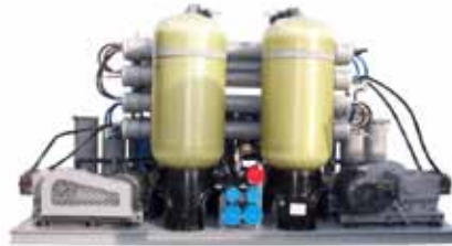
SW Series (back side view)

These models comprise a single skid with two complete, independent RO systems. The two trains can run together or can be operated on a duty/stand by basis. Top quality components, manufactured by Racor Village Marine, provide maximum corrosion resistance. Straight-forward, easy to understand controls, result in reliable operation.