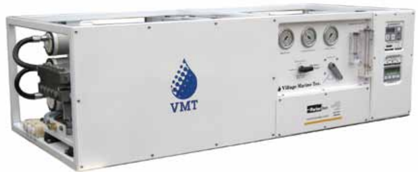
Village Marine PW-400-2000

There are no natural sources of freshwater on the island. The islanders have purchased three of the Racor Village Marine Tec., Pure Water Series units. PW2000, PW1200 and PW600 watermakers. Several located on islands in the Dry Tortugas chain. The water source is the sea. Salt water is converted to potable drinking water for the benefit of many who enjoy the island lifestyle.