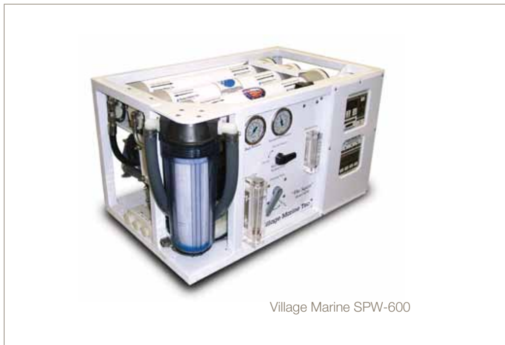
Village Marine SPW-600

The Squirt packages a full feature watermaker in a compact frame. Simple connections allow straight forward installation. The watermaker can be operated and monitored from the electronic remote control.