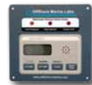
Remote Control Panel

Triplex Titanium pump for low vibration and low noise with unsurpassed corrosion resistance.