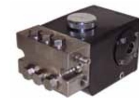
Aqua Pro ® Pump 708-3

Triplex Titanium pump for low vibration and low noise with unsurpassed corrosion resistance.