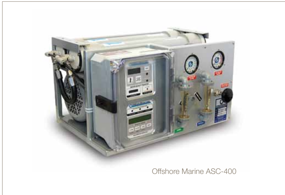
Offshore Marine ASC-400

The ASC units feature a semi modular frame format, for installation flexibility. The frame is compact and can be above or below water line. The boost pump and prefilters are supplied as loose items. The watermaker can be operated and monitored from the electronic remote control.