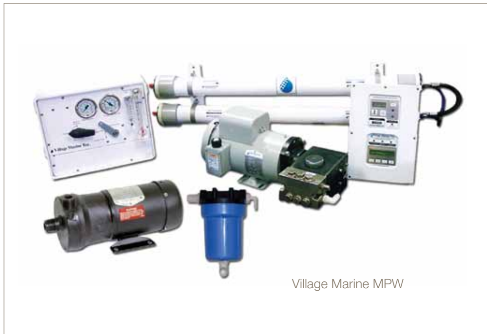
Village Marine MPW

The MPW is a 100% modular watermaker for maximum installation flexibility. All the components are supplied as loose items with mounting brackets to fit in any available space. The watermaker can be operated and monitored from the electronic remote control.