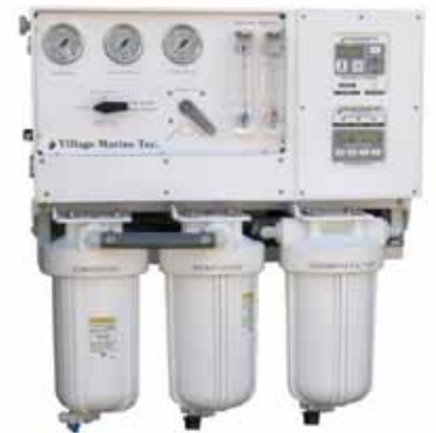
VMT PWS-2000 “Swing”

(Boost pump, media filter and membrane rack supplied as separate components)