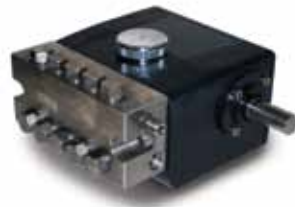
Aqua Pro ® Pump 708-5

(Boost pump, media filter and membrane rack supplied as separate components)