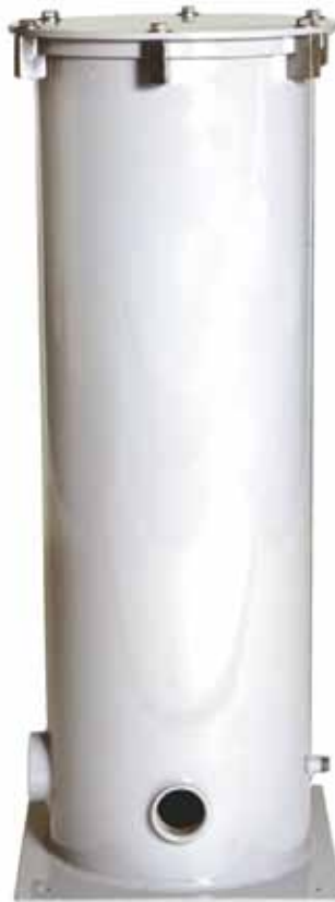
Village Marine 100-X