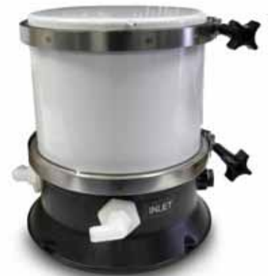
Village Marine 30-S