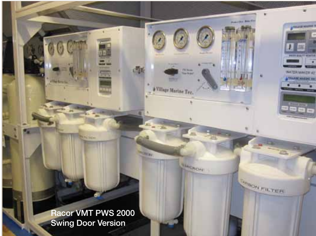
Racor VMT PWS 2000 Swing Door Version

One of the nation's premier custom luxury yacht builders, Christensen Yachts, is located in the beautiful Pacific Northwest in Vancouver, Washington where their craftsmanship is world class. At their renowned American Shipyard they specialize in manufacturing custom mega yachts ranging from 160'-225'. Built with luxuries most celebrities could only imagine, including oversized hot tubs and state of the art gymnasiums, to intricate custom work with stone, glass, and wood throughout each vessel, Christensen Yachts never fails to impress their customers. The goal of many of these yacht owners is to be completely self-sufficient on board so they can travel to just about anywhere, at any time, and still have all the luxuries and privacy they desire. One of the biggest challenges in meeting that goal is securing a reliable source of fresh water while out at sea.