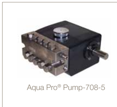
Aqua Pro® Pump-708-5

Parker Hannifin Corporation Filtration Group Racor Division - Village Marine Tec. 2000 West 135th Street Gardena, CA 90249 phone 310 516 9911 fax 310 538 3048 www.villagemarine.com www.parker.com/racor