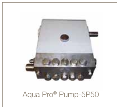
Aqua Pro® Pump-5P50